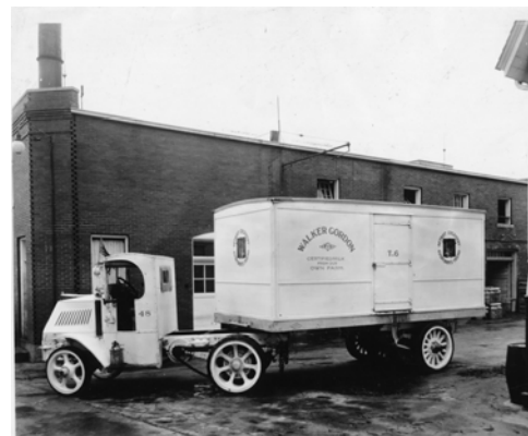
Figure 5: Photoprint of truck from box 34, IV. Transportation--Buses--Taxis, Trucks

Railroads, wagons, carriages, bicycles, and automobiles were some of the forms of transportation used during the years when the DPC produced prints and postcards. Each of these modes of transportation are documented, along with others, in the Transportation subseries (approximately 1,300 photoprints). This subseries contains both the mode of transportation, as well as the infrastructure needed for the transportation mode to be utilized. Documentation of the railroads is particularly strong. Photoprints include images of train tracks, tunnels, locomotives, passenger