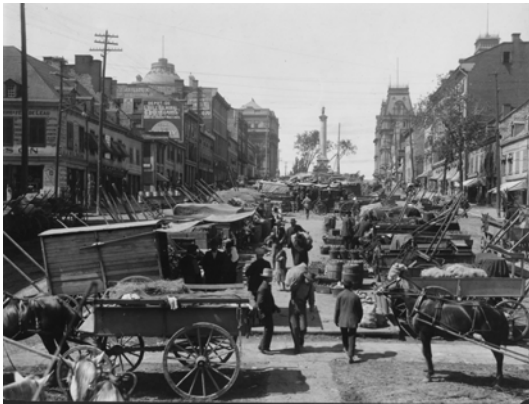
Figure 9: Photoprint of Montreal in box 41, VIII. Foreign Views--Canada--Montreal (3 of 5).