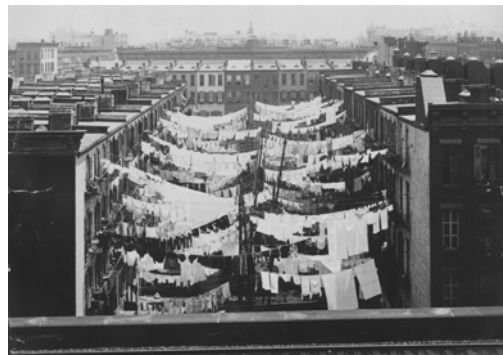
Figure 2: Photoprint of laundry hanging out to dry in New York City, in box 18, I. Architecture--New York--New York--Genre Scenes, City Life.

The Architecture subseries, the largest subseries in the DPC collection, consists of approximately 19,000 photoprints of man-made structures. It includes a variety of types of buildings, bridges, monuments/memorials, and street scenes. The subseries is further subdivided into states, and then cities or towns. Cities/towns may be further subdivided if many different subjects in a particular city were photographed. Particular categories of subject headings to be aware of are Parks, Resorts & Recreational Areas, and Rural Roads & Buildings. It should be noted that the term “parks” refers to city parks, as opposed to national parks. Resorts & Recreational areas include areas which have been developed to accommodate tourists and visitors. Photographs of national parks are included here. (Photographs of particular features of some national parks—such as valleys in Yosemite—may, however, also be included in the Nature subseries.) It should also be noted that this subseries contains many photographs of resort hotels. Photographs labeled with the term “Rural Roads & Buildings” depict country scenes. Modes of transportation are not their main subject. Photographs in which modes of transportation are depicted as the primary subject are found in the Transportation subseries.