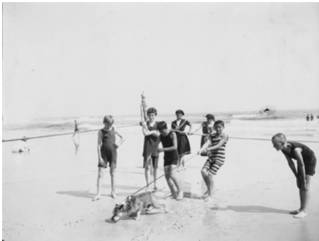
Figure 6: Photoprint of children at the beach in box 39, V. Sports & Recreation--Water Sports--Swimming, Beaches--New York--Rockaway.

The Sports & Recreation subseries (approximately 4,500 photoprints) illustrates ways in which people at the beginning of the Twentieth Century spent their leisure time. This subseries includes photographs of sports such as baseball, football, fishing, and golf. Winter sports and water sports are also represented. Non-sport related activities include camping and card games. The Sports & Recreation subseries is divided into groupings according to specific sport or type of activity. These are further subdivided into either