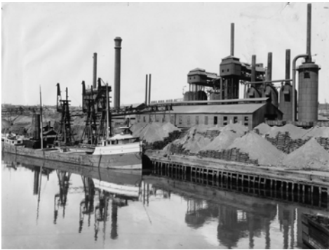
Figure 4: Photoprint of a smelter in box 33, III. Production--Manufacturing/Industry--Metal Work, Smelters--Ohio--American Steel & Wire Co.

of the Petrified Forest in Arizona, and Niagara Falls. Extensive photographic documentation of the Grand Canyon, as well as the various features of Yosemite and Yellowstone, reflect the importance of these subjects.