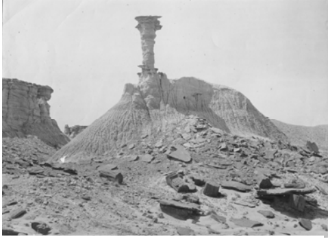
Figure 3: Photoprint of the Petrified Forest in box 28, II. Nature--Arizona--Petrified Forest.