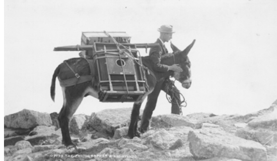
Figure 1: The Photographer's Assistants Object ID # P.DPC.07173.A

The keystone of the company's success, pioneer American photographer William H. Jackson, joined the venture in late 1897, bringing 10,000 of his superb glass-plate negatives to form the core of the visual publication material. In his early years with the company, Jackson traveled throughout the United States,