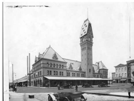
Figure 1: Retouched photoprint from Box 33, III. Production--Manufacturing and Industry--Photographic Companies--Detroit Photographic Company--Production

The DPC relied heavily on retouching to create final photochrome prints. Photographs were often retouched to visually enhance the image. The removal of telephone lines/poles, or other “unsightly” objects was common. Images were also retouched to reduce the number of new negatives which had to be created each year. Photographic historian Peter B. Hales states that the DPC used retouching to modernize images. To do this, they would change things such as the length of women’s skirts, or paint over older automobile models and carriages. 1 New