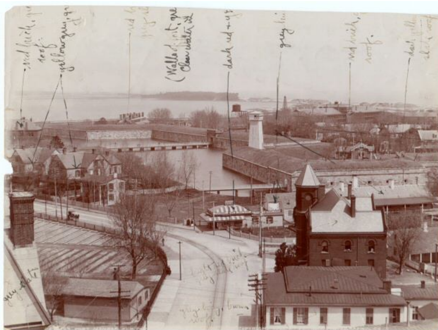
DPC Number: 018481 Obverse (THF597)