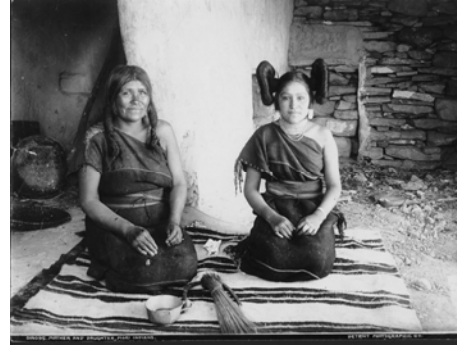
Figure 8: Photoprint of Native Americans in box 40, VII. Ethnic Groups--Native Americans--Southwest—Pueblo (1 of 3).

The Ethnic Group subseries (approximately 300 photoprints) reflects historical attitudes of the dominant, European-based society at the beginning of the Twentieth Century toward non-European cultures. This subseries, subdivided according to ethnic groups, is comprised of photoprints of Native Americans, African-Americans, Sinti-Roma (Gypsies), and Asians. Many of the photographs reflect racist stereotypes of the time.