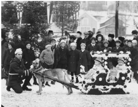
Figure 7: Photoprint of the Midwinter Carnival in box 40, VI. Special Events--Celebrations--Midwinter Carnival, Saranac Lake, New York.

geographic categories or specific events. This subseries contains many images of beach-goers enjoying swimming and playing in the water. The folder containing photographs of photographers is also interesting. One of the subjects which it illustrates is the photographic process using large format cameras.