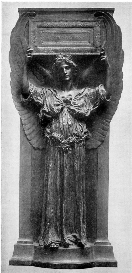
"AMOR CARITAS" Bronze Relief by Augustus Saint Gaudens. Purchased by popular subscription.