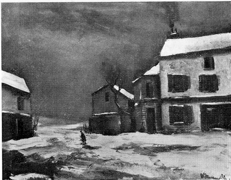
WINTER LANDSCAPE BY MAURICE VLAMINCK

painter of flowers on china, and something of the enamel-like and saturated quality of colour which he had learned to use in practising that trade clung to his work through life. In order to show that it is not merely the Philistine public that finds it difficult sometimes to understand the work of a great artist,—and Renoir is unquestionably a great artist—one may quote the story of how Manet, himself the most accomplished painter of his generation and entirely without envy towards his fellow-craftsmen, went to Monet, who was a particular friend of Renoir, in order to get him to persuade Renoir to give up painting because he had no talent for it and was only wasting his time. And Manet was the ardent champion of the younger generation! Renoir's history was somewhat different from that of most of the impressionists. He never adopted quite whole-heartedly the scientific and rather abstract theories of Monet and his circle, and later in life he developed into what was in a sense the very opposite