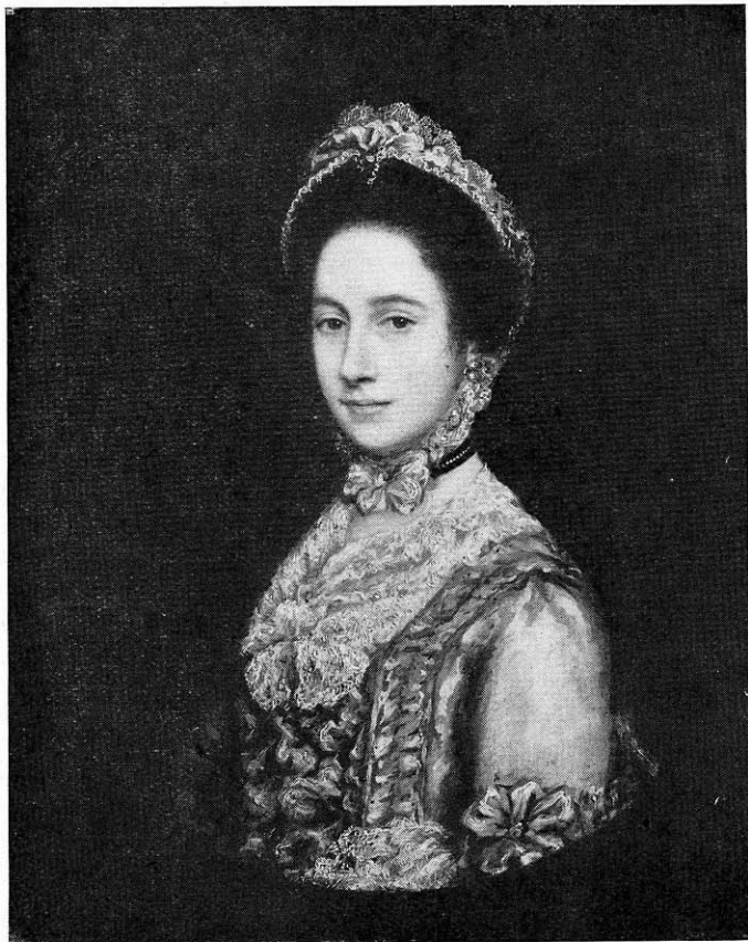
MRS. MEAD BY THOMAS GAINSBOROUGH