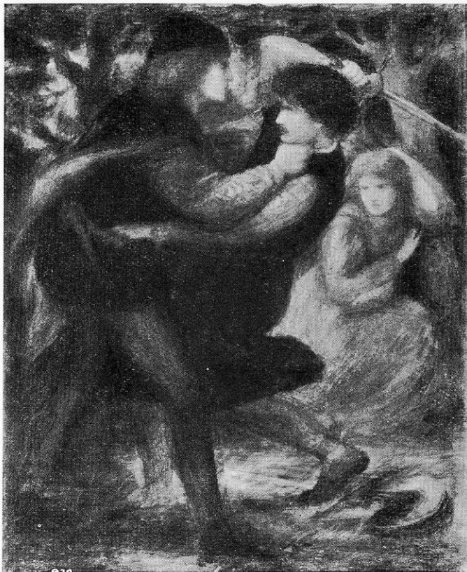
A FIGHT FOR A WOMAN BY ROSSETTI

the dogma, and his Annunciation in the Tate Gallery can hardly be considered a success. By 1857, however, he had become more the master of his tools, and in the study of such books as Malory's Morte d'Arthur and Froissart's Chronicles , he found a material that moved his