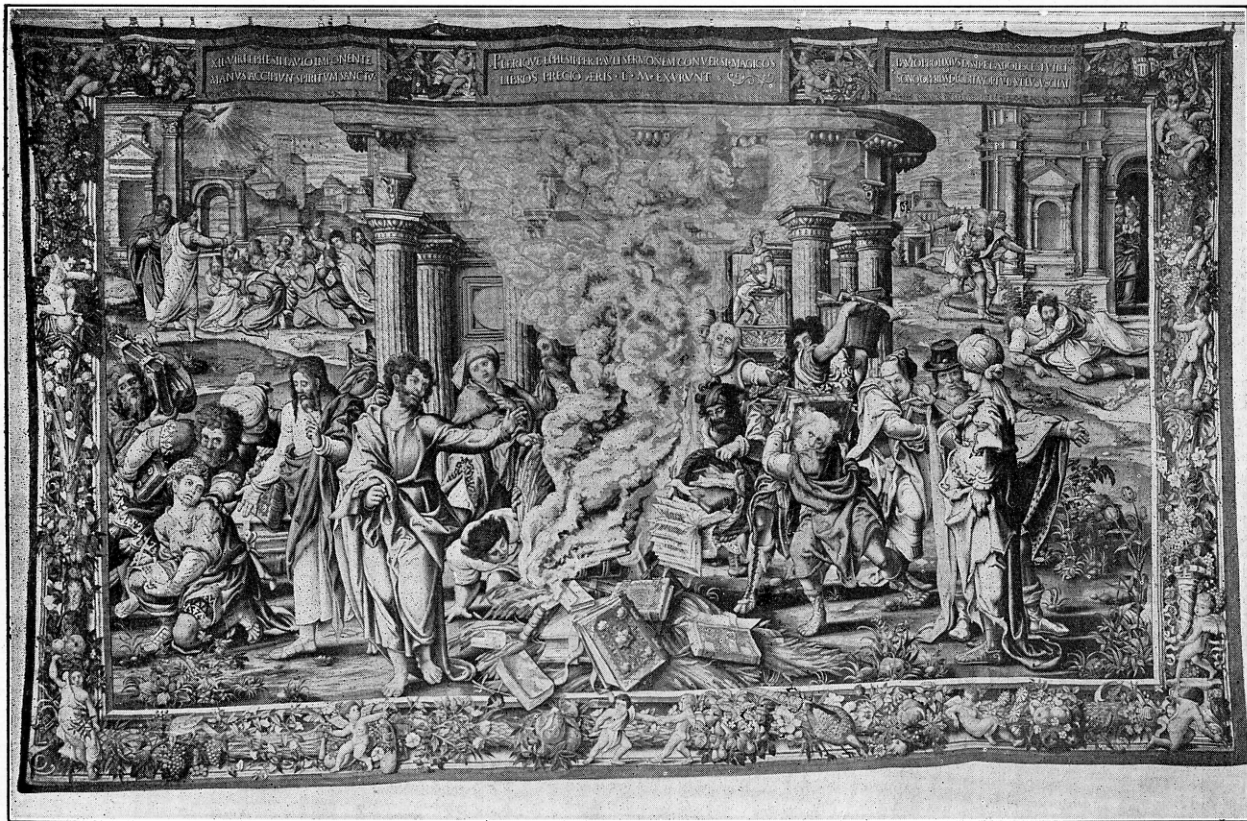
THE BURNING OF THE BOOKS ONE OF A PAIR OF XVI CENTURY FLEMISH TAPESTRIES REPRESENTING SCENES FROM THE LIFE OF ST. PAUL PRESENTED BY THE DETROIT MUSEUM OF ART FOUNDERS SOCIETY