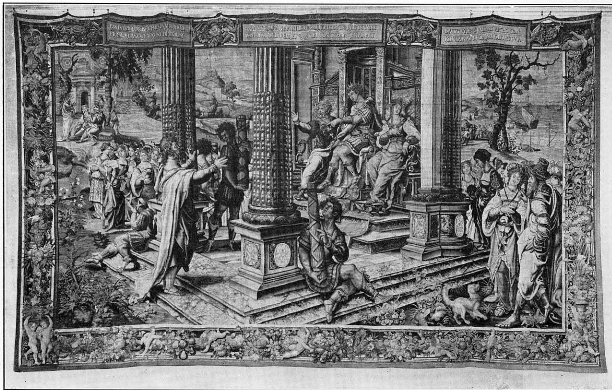
ST. PAUL BEFORE PONTIUS FESTUS, KING HEROD AGRIPPA AND HIS CONSORT BERENICE ONE OF A PAIR OF XVI CENTURY FLEMISH TAPESTRIES REPRESENTING SCENES FROM THE LIFE OF ST. PAUL PRESENTED BY THE DETROIT MUSEUM OF ART FOUNDERS SOCIETY