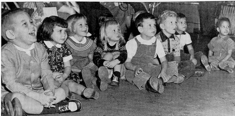
Viewing a film, "The Three Pups," prior to a Pre-School Workshop session devoted to painting animals