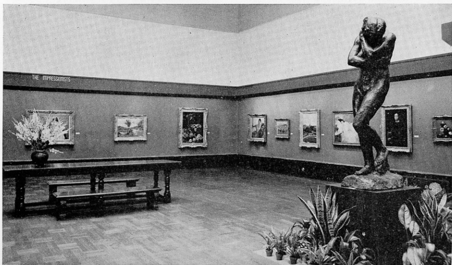
"The Impressionists" section of the exhibition The Two Sides of the Medal: French Painting from Gérôme to Gauguin

The Archives of American Art are national in scope and will appeal for national support. However, our own museum membership was asked to give the project its interest and assistance. A solicitation letter addressed to members of the Founders Society and other special local lists realized gifts of money in varying amounts from 119 people. Gifts of $5 or more from non-members of the Founders Society automatically enroll them as members of the Society. Gifts of $25 or over entitle the donor to receive four issues of the Art Quarterly which is the official organ of the Archives as explained above.