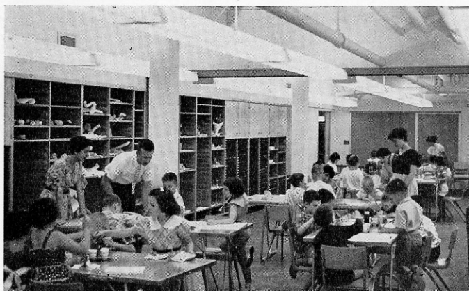
New quarters for Museum Workshops, opened July, 1954

Plans and specifications for the first phase of our air conditioning program, which will provide summertime cooling and humidity control for all the galleries, have been prepared by the engineering firm of Hyde and Bobbio and are ready to be sent out for bids.