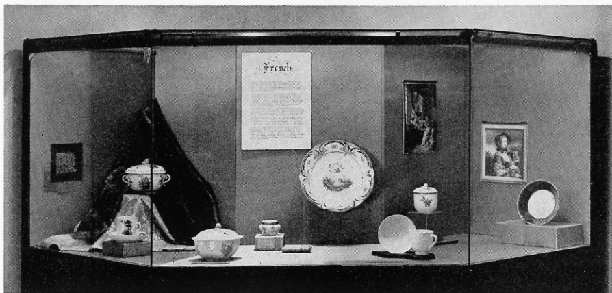
A case from 18th century Porcelain from the Museum Collection, one of the teaching exhibitions with explanatory labels arranged by members of the Education Department