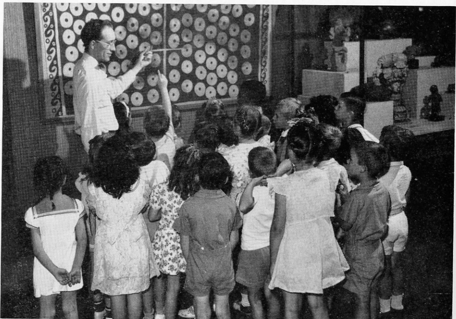
MUSEUM CLASSES FOR CHILDREN. After painting repeated patterns, first and second grades go to the galleries to see and discuss works of art related to their activity.

The out of school classes for children were expanded last year so that a greater number of children and a wider age range could have the opportunity of becoming