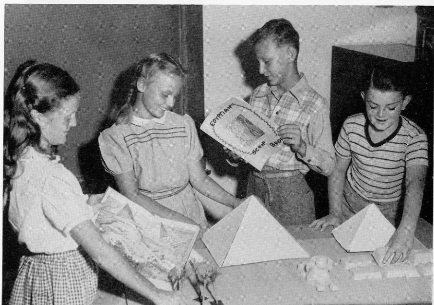
MUSEUM CLASSES FOR CHILDREN. Construction projects and scrapbooks appeal to fifth and sixth grade students in studying Egyptian art.