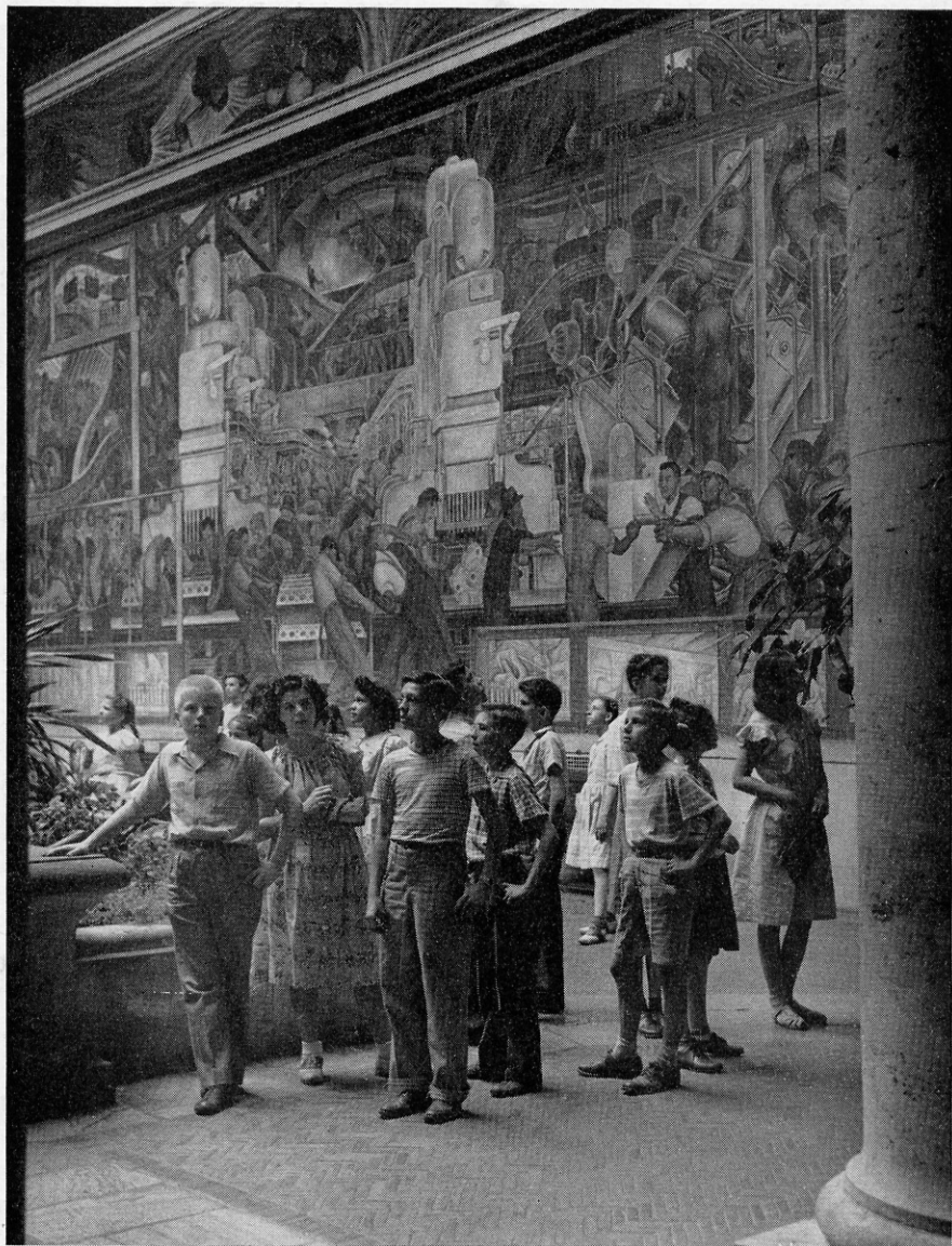
MUSEUM CLASSES FOR CHILDREN. Since the creative activities in all Museum classes for children and adults as well are directed toward a better understanding of the collections, a part of each class period is spent in the galleries.