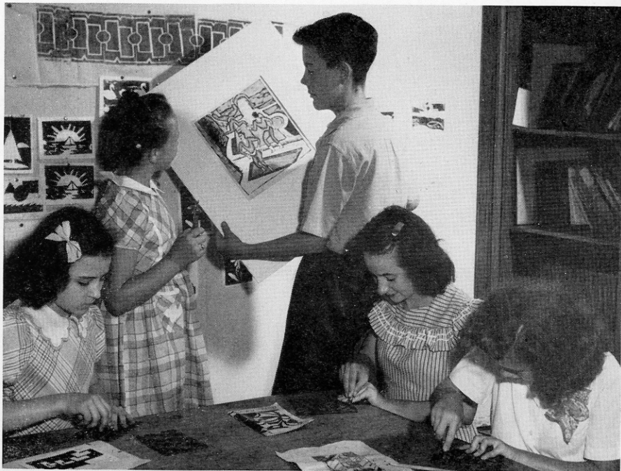
MUSEUM CLASSES FOR CHILDREN. Seventh and eighth grade students learn print techniques and become acquainted with prints in the collection as they cut linoleum blocks.

Charles Willson Peale, Self Portrait —old discolorations in varnish removed.