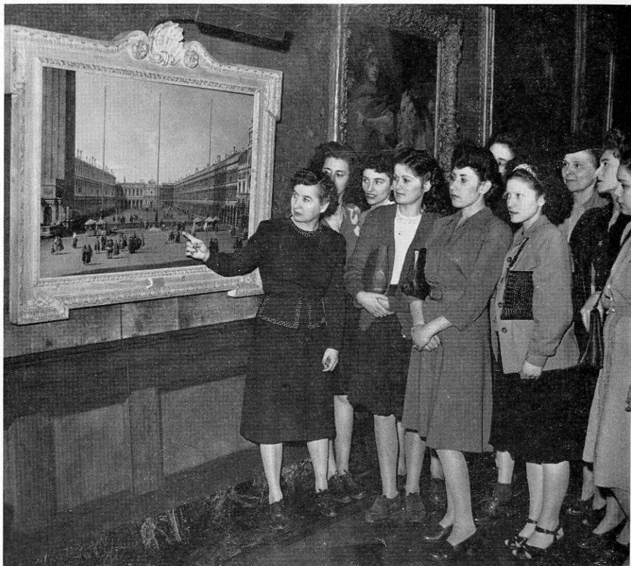
ADULT EDUCATION. Among the adult groups who arranged for special talks in the galleries was a group of war brides from various European countries.