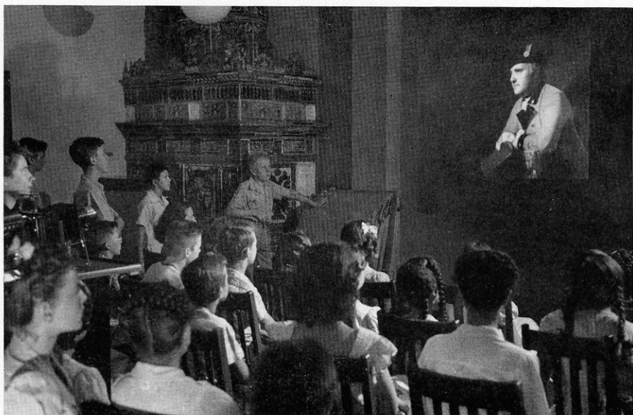
MUSEUM CLASSES FOR CHILDREN. Slides are shown to explain and illustrate the day's activity in the classes conducted by the Museum educational staff for children during out of school hours.

One of the outstanding events of the fall was the symposium of lectures in October on the exhibition, The Arts of French Canada , presenting six lectures by scholars in the field and its relation to Detroit history.