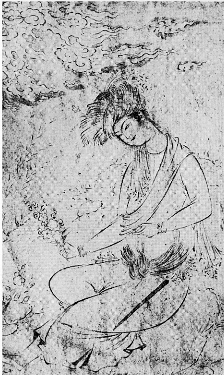
Fig. 4. YOUNG MAN WITH A BOUQUET OF FLOWERS, SIGNED AQA RIZA. Bibliothèque Nationale, Paris.

Through the acquisition of a rare silk fabric, 3 Riza-i-Abbasi is shown as one of the truly great designers for the medium of the loom (Fig. 1).