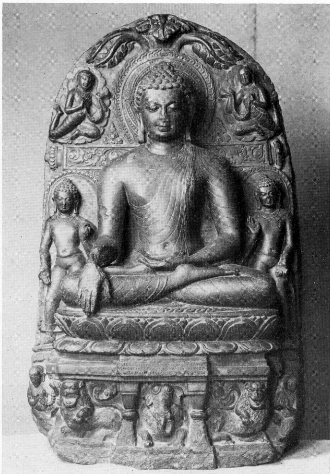
BUDDHA CALLING THE EARTH TO WITNESS INDIAN, NINTH CENTURY A.D. Lent by the Cleveland Museum of Art to the TWENTY-FOURTH LOAN EXHIBITION: BUDDHIST ART; OCTOBER, 1942.

The Detroit Institute of Arts, 5200 Woodward Avenue, is open free daily except Mondays and Christmas Day. Visiting hours: Tuesday, Wednesday, Thursday and Friday afternoon, 1 to 6; Tuesday, Wednesday, Thursday and Friday evenings, 7 to 10; Saturday, 9 to 5; Sunday, 2 to 6. The grounds of the Russell A. Alger Branch Museum for Italian Renaissance Art are open daily. The Museum is open Saturday, 10 to 6; Sundays, 2 to 6.