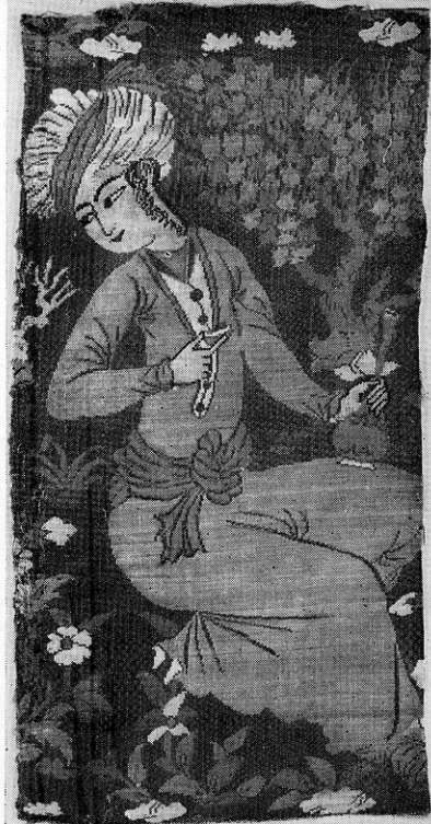
Fig. 1. YOUNG MAN DRINKING WINE, SILK CLOTH, PERSIAN, SEVENTEENTH CENTURY A.D. Gift of the Founders Society, Octavia Bates Fund. 1942.