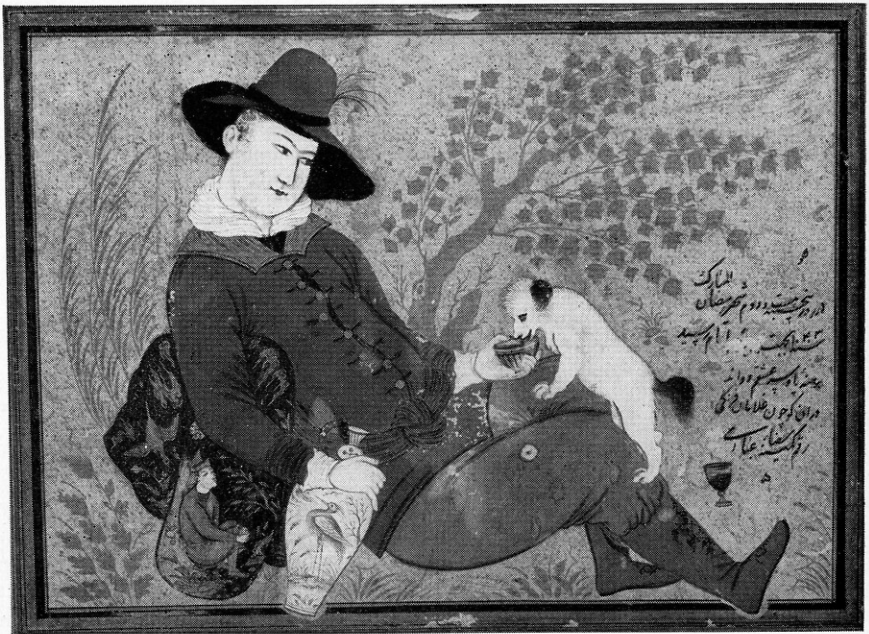
Fig. 2. YOUNG PORTUGUESE WITH DOG. Collection of Dr. W. R. Valentiner.

Yet even more beautiful is the textile fragment lately acquired. We quote from Dr. Ackerman's perfect description: "One of the most remarkable of the Safavid personage textiles, for its combination of style and precision of drawing, beauty of plant accessories, and freshness and originality of color, is a rose-ground compound cloth with the figure of a seated young aristocrat, drinking. This charming dandy is even closer to the Bibliothèque Nationale drawing of an 'Adolescent' (Fig. 4) than the falconer on the velvet (of the Cleveland Museum of Art), though