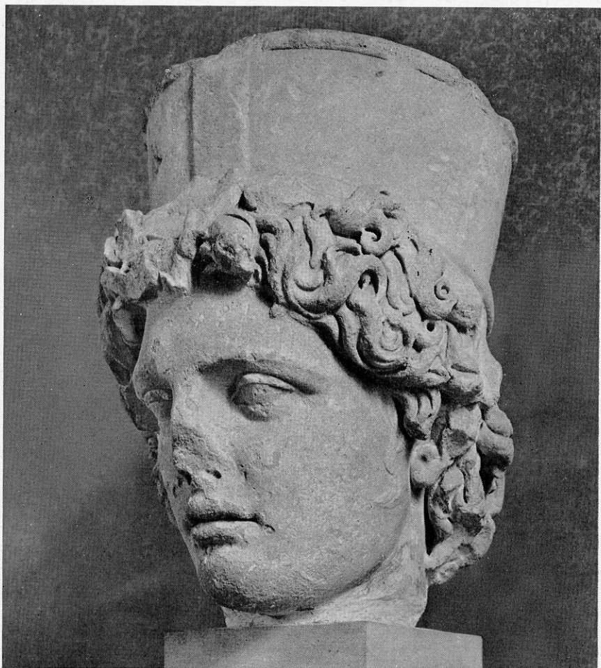
GODDESS OF A CITY, OR CYBELE (?) GREEK, FOURTH CENTURY B. C.