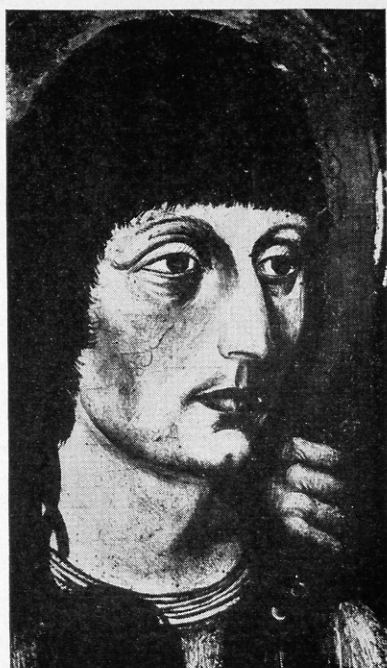
MEMMINGER ALTARPIECE (detail) BY MICHAEL WOLGEMUT Lorenzkirche, Nuremberg (fig. 2)

churches, one in the Kreuzkirche, executed about 1480-85, and the other in the Lorenzkirche of 1488-90. At the same time a number of characteristic portraits could be identified with the help of the portraits of donors in these altarpieces.