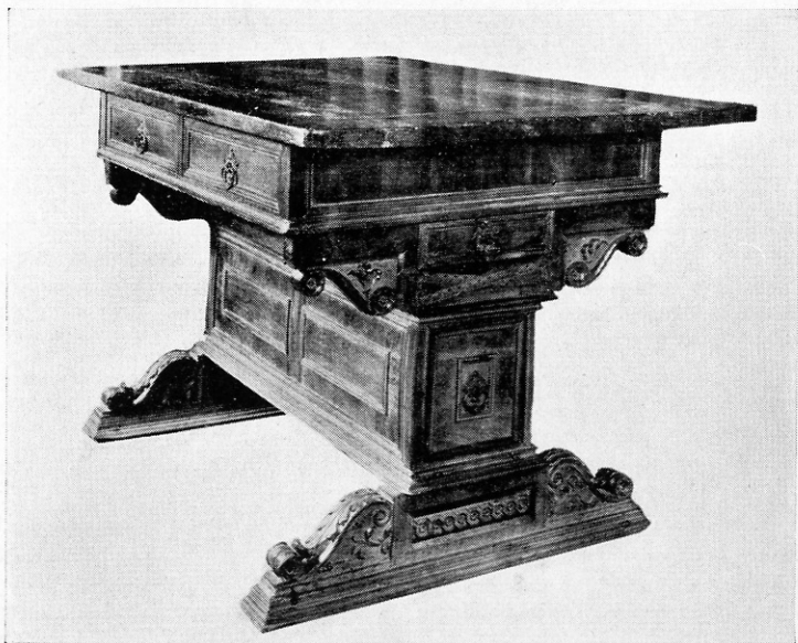
WRITING TABLE ITALIAN, ABOUT 1500 Purchased by the Detroit Institute of Arts, 1939

AN Italian Renaissance writing table 1 , recently purchased by the Detroit Institute of Arts, is a distinguished addition to the Alger House collection, not for its beauty alone, but for its rarity as a type, and for the remarkable high quality of the cabinet-making. Its exact date and origin are hard to determine. The simplicity and reticence of its form, the almost shy appearance of ornament, the light-toned walnut, the combined use of carving and intarsia (or inlay), all suggest the period of transition between the Early and High Renaissance, and approximately the year 1500. The ornamentation of Florentine furniture is always conceived on broad constructive lines, closely integrated with and expressive of the furniture form. The disre-