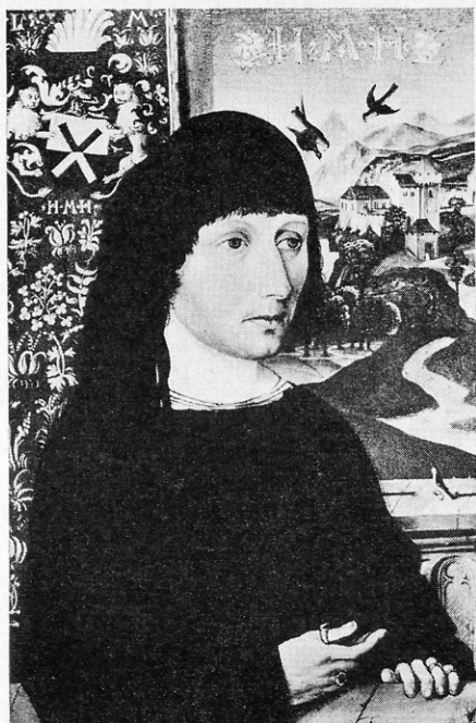
PORTRAIT OF LEVINUS MEMMINGER BY MICHAEL WOLGEMUT Private Swiss Collection (fig. 1)