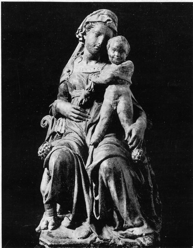
VIRGIN AND CHILD ENTHRONED BY LORENZO Ghiberti, ITALIAN (FLORENCE), 1378-1455. Recently acquired through the Ralph H. Booth Fund and published in "The Art Quarterly," Spring, 1940.