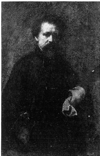
( ABOVE ) SELF PORTRAIT BY EASTMAN JOHNSON AMERICAN, 1824-1906.

The exhibition of his picture known as My Old Kentucky Home won him election to the National Academy of Design in 1860, and in conformity with custom he was asked to present to that body a portrait of himself. That portrait formed one of the interesting items of the recent Brooklyn exhibition and was used as a frontispiece in the catalogue. It is here again reproduced.