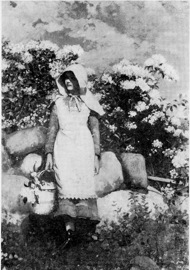
GIRL AND LAUREL BY WINSLOW HOMER AMERICAN 1836-1910.