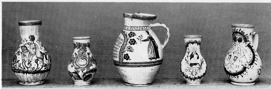
DECORATED POTTERY PITCHERS SLOVAK, NINETEENTH CENTURY

Gift of the Art Museum Slovak Section, 1940