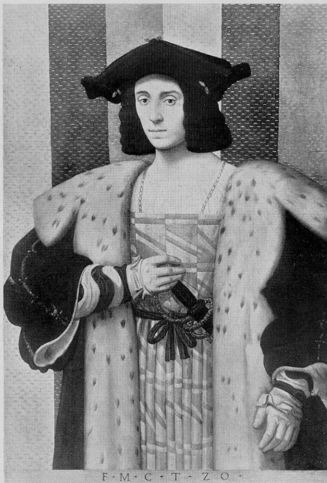
PORTRAIT OF A GENTLEMAN OF THE TRIVULZIO FAMILY BERNARDINO DEI CONTI ITALIAN (MILAN), ACTIVE 1496-1522