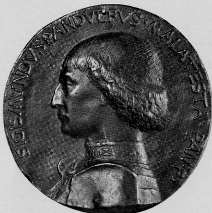
MEDAL OF SIGISMONDO PANDOLFO MALATESTA MATTEO DEI PASTI ITALIAN (VERONA AND RIMINI), ACTIVE 1441-1467/68 GIFT OF THE FOUNDERS SOCIETY