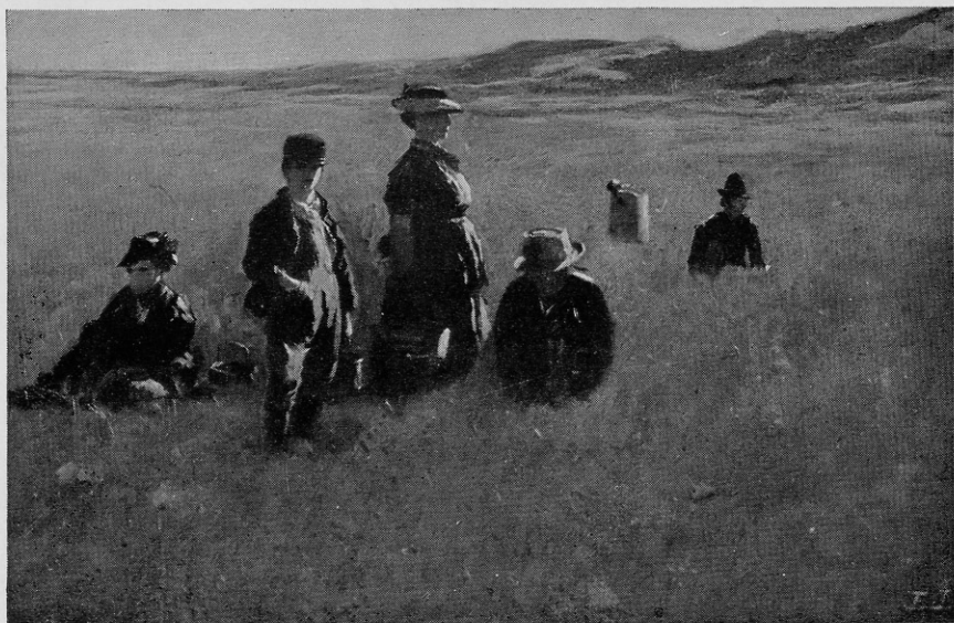
EASTMAN JOHNSON 1824-1906 "IN THE FIELDS"

and enrolled in the Academy of Düsseldorf, then at the height of its fame. The academic training refined his draughtsmanship and instilled a taste for the realistically rendered sentimental anecdote. From 1851 to 1855 he worked at The Hague, occupying his talents with copying Rembrandt and painting portraits, with such success that he could have remained as court painter to William III. 1856 saw him in Paris, in the atelier of Couture. Returning to America he sought out the native scene in Wisconsin, Kentucky, and lastly, Nantucket. Paris and Düsseldorf had taught him to be tasteful in the arrangement of figures, to respect a realistic appearance and the proper amount of literary content; Rembrandt confided something of the secret of significant light, illumination which reveals the quality of form. At the same time, he far outreached the international academic manner, which reported so minutely "a generation that melted