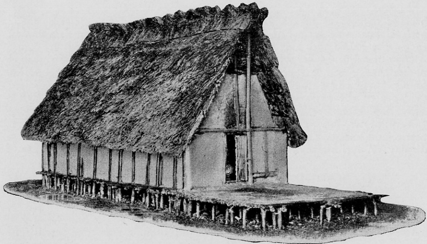
MODEL OF A NEOLITHIC HOUSE C. 2200 B.C.

The Museum was able to acquire models of houses, and copies of other objects in the original size, carved in the same wood the lake-dwellers used. This was made possible through the courtesy of Prof. Hans Reinerth, of Berlin, who excavated the sites in cooperation with the Modellwerkstatt des Reichsbundes für Vorgeschichte. The main model is a rectangular house with a porch on the gable side and a platform in front. Inside there were two rooms, the first was used as a kitchen, and contained the bake-oven. In order to show the structure of the oven a separate model is displayed; such ovens were built of willow twigs and wickerwork plastered on both sides with clay. The second room was a living room, and had, besides a fireplace, a ceiling, which prevented drafts from the thatch and formed a kind of attic.