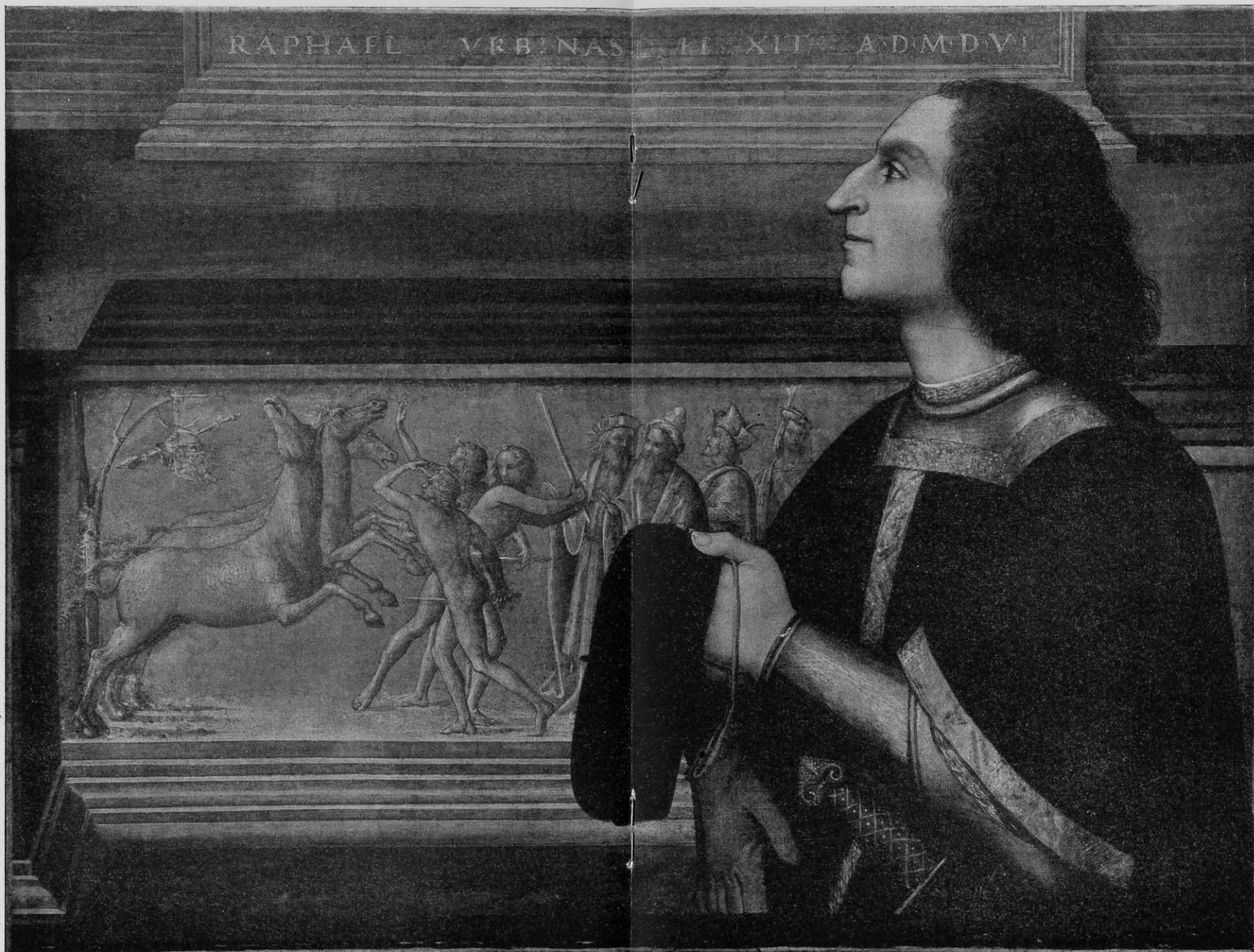
FIG. 4—PORTRAIT OF A DONOR BY RAPHAEL RALPH H. BOOTH FUND