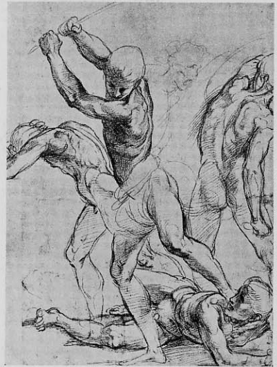
FIG. 6 BRITISH MUSEUM

painting. As it is not very wide (within the frame 21\frac{3}{4} inches) it is natural to suppose that the picture above was a Madonna painting of not too large a compass. Now we know that Raphael painted in the year 1506 (1505 according to others) the Madonna in Green , and that this is one of the two pictures which, according to Vasari, he painted for Taddeo Taddei, the wealthy Florentine art patron in whose house Raphael stayed while he was in Florence. Vasari does not mention what these two paintings in the possession of Taddeo were. But when Baldinucci, 1 a century later (about 1660) visited the palace of the heirs of Taddeo Taddei, he found that there remained only one painting, representing the Madonna, and, as he relates, shortly thereafter this was sold to the Archduke Ferdinand Carl of Austria. From his description this painting can be identified with the Madonna in Green , which, toward the end of the eighteenth century found its way from the Hapsburg castle Ambras into the Belvedere in Vienna. 2 Had the other painting also