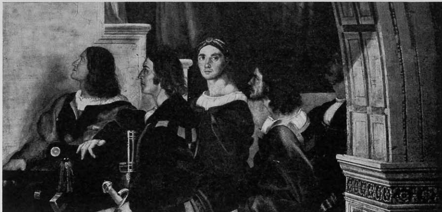
FIG. 8—DETAIL OF THE MASS OF BOLSENA, VATICAN