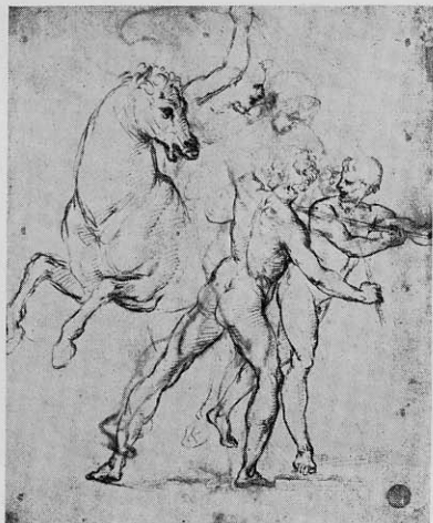
FIG. 7 ACADEMY, VENICE

Vasari says that the two paintings belonging to Taddeo Taddei combined well the Umbrian and Florentine manner of Raphael. This is true both of the Madonna in Green and our painting. We find the motif of a donor, in profile and half length, praying before the Madonna, more than once among Raphael's predecessors in Umbria. Pintoricchio is a case in point in his altarpiece in the cathedral of Sanseverino and in the panel in the Ambrosiana in Milan. Raphael did not use it again in his Umbrian or Florentine period, but in his Roman period he returns to the representation of portraits in profile more than once. Although these examples belong to a later period and are executed in a different medium (in fresco) they may well be compared with our portrait, not only in the way the figures are contrasted with an architectural background, but also in the design of the profile itself. In the heads of