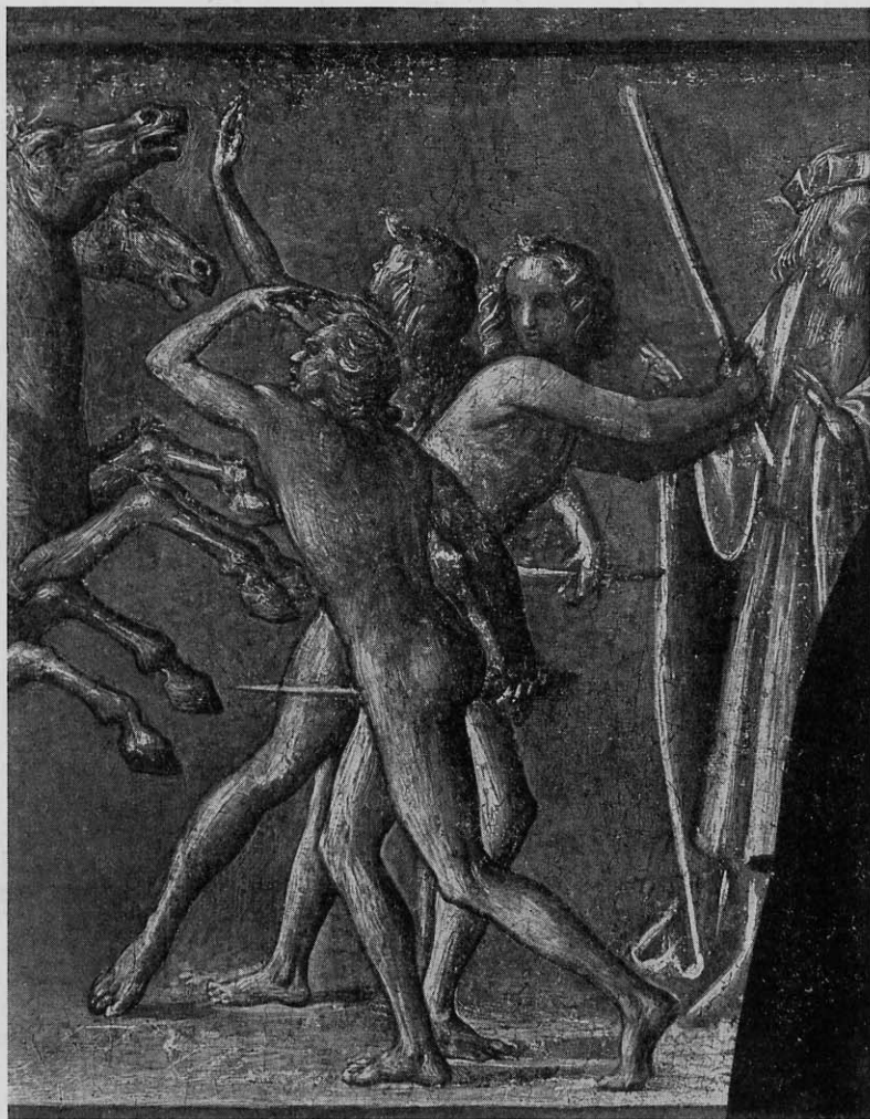
FIG. 1—DETAIL OF PAINTING BY RAPHAEL