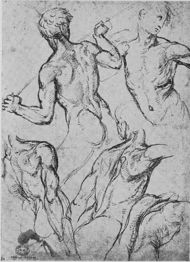
FIG. 5 OXFORD

facts militate. First, no such altar is mentioned in the documents, and we are rather well informed by contemporary descriptions about the large altarpieces which Raphael executed at this time; secondly, the perspective of the architecture in our painting speaks clearly against any such supposition. If our painting had formed the right part of an altar, the focus for the architectural perspective would be a considerable distance to the left of our composition. In other words, the lines of the mouldings leading inward would have been drawn from the right foreground to the left background, whereas they actually convey toward the center. Our painting was therefore composed as a work complete in itself. The further fact that the base which carries the inscription is exactly centered between the two retreating mouldings on either side also supports this.