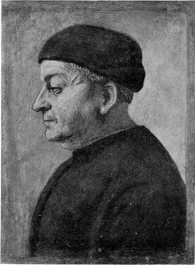
PORTRAIT OF AN OLD MAN DOMENICO GHIRLANDAIO FLORENCE, 1449-1494 GIFT OF THE DETROIT MUSEUM OF ART FOUNDERS SOCIETY