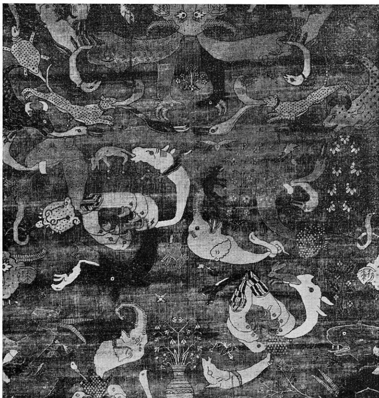
FRAGMENT OF AN INDIAN CARPET