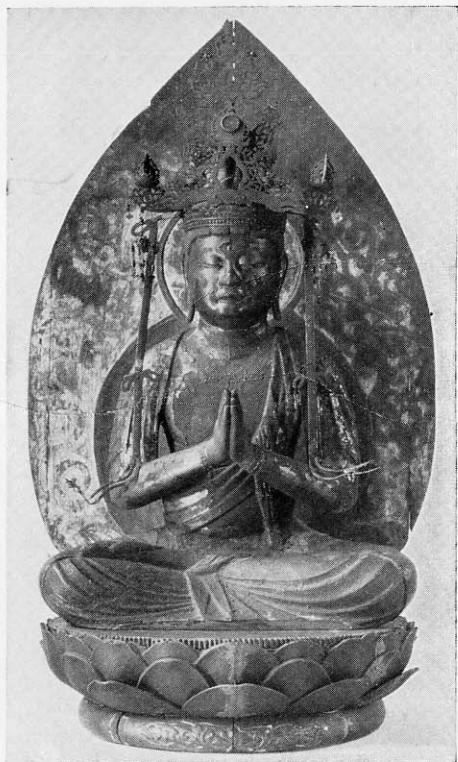
SEISHI BOSATSU JAPANESE. X CENTURY

Among the purchases of Chinese works of art the small mural of four Buddhistic heads from Kizil in Central Asia is especially noteworthy. In spite of its very fragmentary condition, the free precision