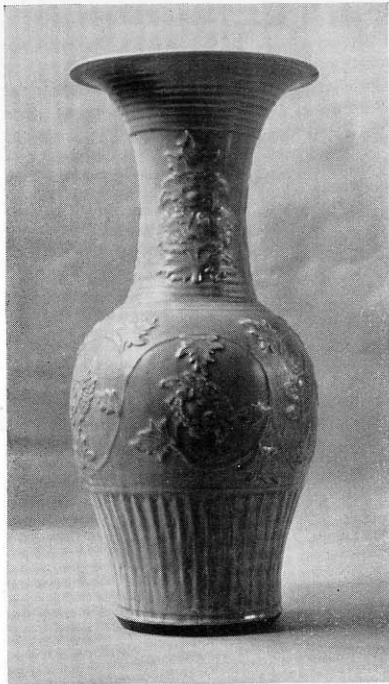
CHINESE LUNG-CH'UAN CELADON VASE SUNG DYNASTY

their art students inspiring material for their handiwork and at the same time gives them an ever wider knowledge of the art of the past.