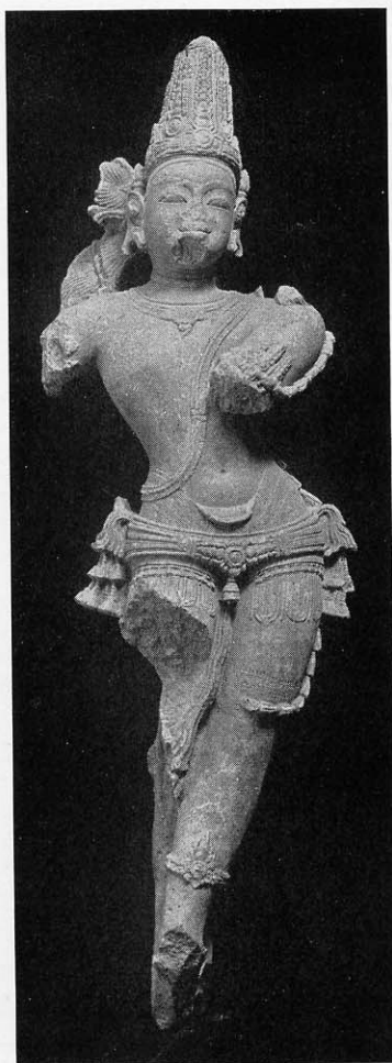
ATTENDANT DIETY EAST INDIA. IX CENTURY