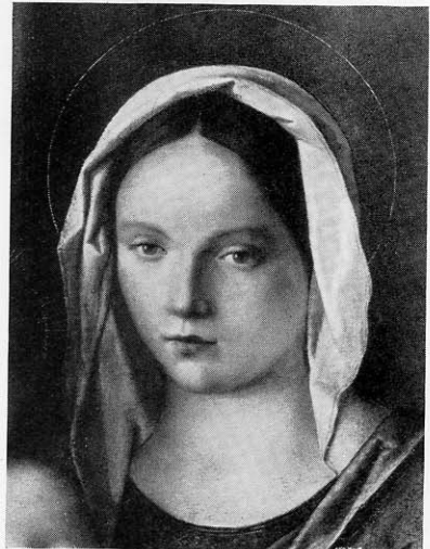
DETAIL OF MADONNA FROM THE BOURBON MADONNA BY GIOVANNI BELLINI

First in importance of our educational activities are the exhibitions which have been held during the year. Two of these were loan exhibitions of Old Masters of exceptional importance: in February, an exhibition of twenty-two important paintings by Titian, borrowed from public and private collections, showing many phases of this great Venetian master of the sixteenth century; in November, a loan exhibition of French Gothic Art of the thirteenth to the fifteenth century, including not only paintings, tapestries and decorative arts, but many important stone sculptures of the period of the great cathedral building which, owing to the difficulties of transportation, has seldom been attempted.