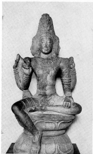
BRAHMA IMAGE INDIA, X-XI CENTURY