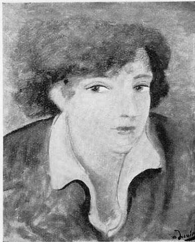
GIRL WITH RED HAIR ANDRE DERAIN

The Art Institute is a source of constant pleasure and enjoyment to the casual visitor; but it is more than that. With its study rooms and its well equipped staff of curators it is now a sort of university of the fine arts, providing scholarly courses of free lectures for all who care to take advantage of them. The services of these curators are also constantly at the disposal of the people of Detroit who wish advice on artistic matters.