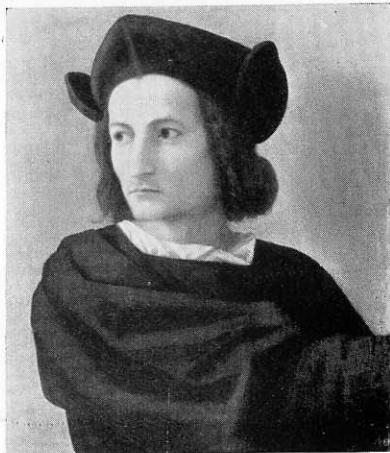
PORTRAIT OF A MAN FRANCIABIGIO

A superficial inspection of the different galleries in the museum may lead to the conclusion that, because every period is represented with a series of objects and every room seems to have a sufficient number of exhibits on its walls, the collections are fairly well completed. Such a conclusion, however, would be quite erroneous. The ambitious aim of creating a museum of masterpieces has hardly begun to be realized. Every room has to be worked out in detail, and although we have made decided progress with several galleries, the available funds are very quickly exhausted, as was obvious when the attempt was made to round out the French eighteenth century room, upon which we concentrated our main attention during the past year. This room contained original Louis XV panelling, an Aubusson rug, a small bench and one painting, a Still Life by Chardin. There were no examples of the beautiful handicrafts, the bronze casting and gilding, the inlaid wood work, and no sculptures, and the art of real Rococo painting was not represented. We succeeded in giving an entirely different aspect to this room. The great painters of the Louis XV and XVI period, Lancret, Fragonard and Robert, now lend colour to the walls by their bright com-