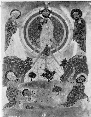
THE TRANSFIGURATION CLOISSONE ENAMEL ON GOLD BYZANTINE. XII CENTURY

figure of such quality that it loses little by being damaged, represents a deity, attendant, probably, upon the Sun God. It is from eastern India, the state of Orissa, and dates from the ninth century. Its fine finish and the voluptuous vitality of its swaying body present a warm contrast to the austerity of the Brahma.