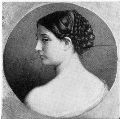
PORTRAIT OF A LADY JEAN AUGUSTE DOMINICUE INGRES