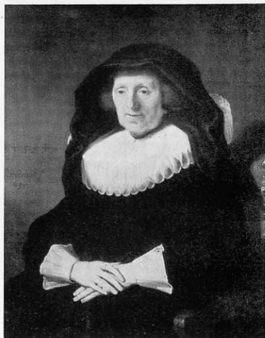
PORTRAIT OF A LADY REMBRANDT

The regular work of the educational department has also continued to show an